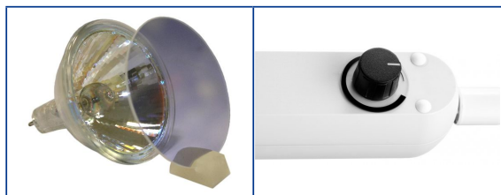
Colour Correction Filter 3800+/- 200K